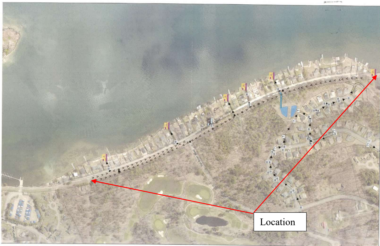
Aerial – Paugus Park Road, Laconia